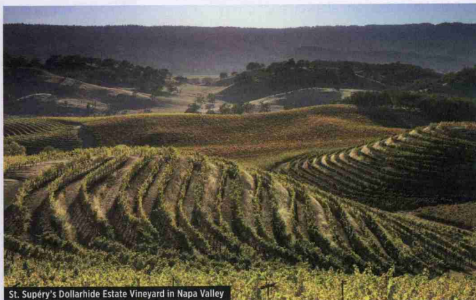
St. Supéry's Dollarhide Estate Vineyard in Napa Valley

Unlike most Sauvignon Blanc producers, Rave also sorts out grapes on the table before press. She then ferments the wines in 100% new